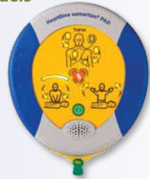
samaritan PAD 500P Trainer with CPR Rate Advisor Simulation (TRN-500-xx)