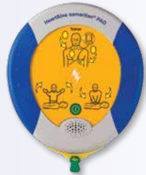
samaritan PAD 360P Trainer (TRN-360-xx)