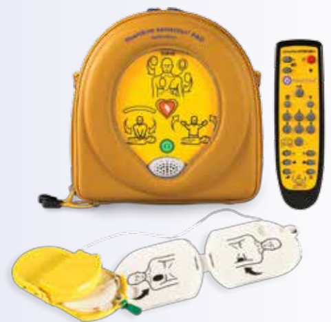
The Whole Package. The HeartSine samaritan PAD Trainer package includes remote control with AAA batteries, Trainer-Pak, battery charger, soft carry case with two zipper compartments, user manual, and three pairs of training electrode pads.

The Trainer is powered by a rechargeable battery. Electrode pads are cost-effective and reusable, and mimic the Pad-Pak battery/pad cartridge unique to the HeartSine samaritan PAD defibrillator.