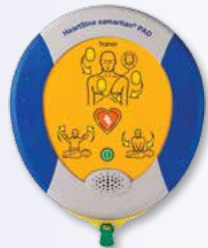
samaritan PAD 350P Trainer (TRN-350-xx)

EMEA/APAC HeartSine Technologies, Ltd. 203 Airport Road West Belfast, Northern Ireland BT3 9ED Tel: +44 28 9093 9400 Fax: +44 28 9093 9401 info@heartsine.com