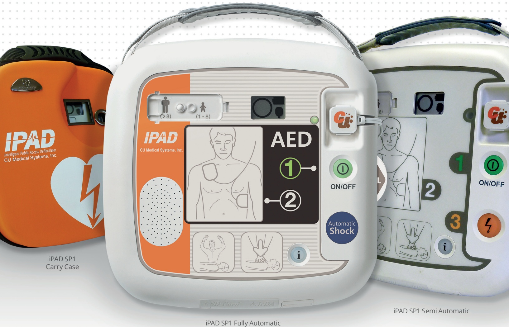
iPAD SP1 Carry Case